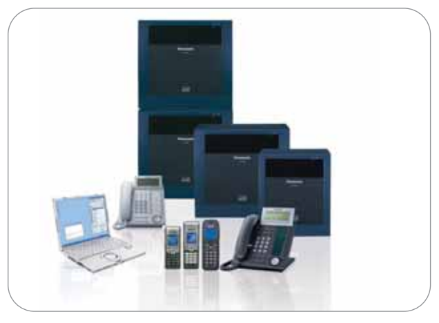
THE TDE SERIES COMMUNICATION PLATFORMS

Convergence ready, modular, extensible, flexible, SIP enabled, and providing built-in support for unified communications productivity applications; the KX-TDE series are ideal communication platforms for customers to solve all their business communication needs today as well as in the future as they embrace Unified Communications together with full IP telephony. These systems are designed to be easy to install, cost effective to run and quickly provide a good return on investment.